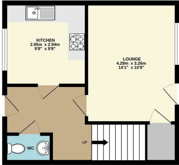
GROUND FLOOR 35.4 sq.m. (381 sq.ft.) approx.